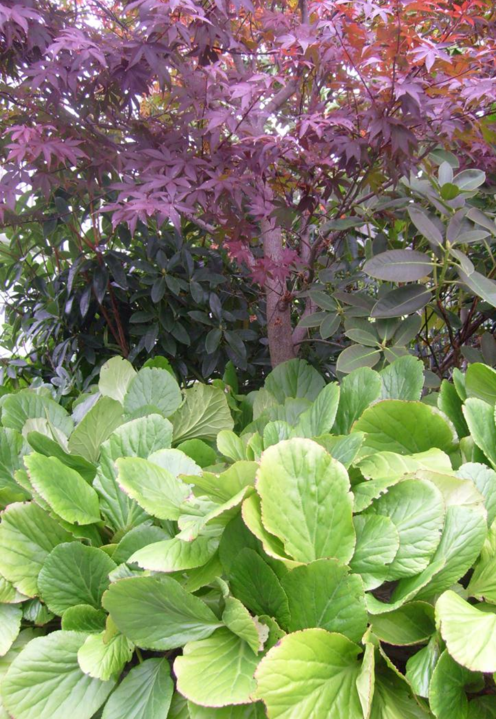
Acer palmatum 'Bloodleaf'