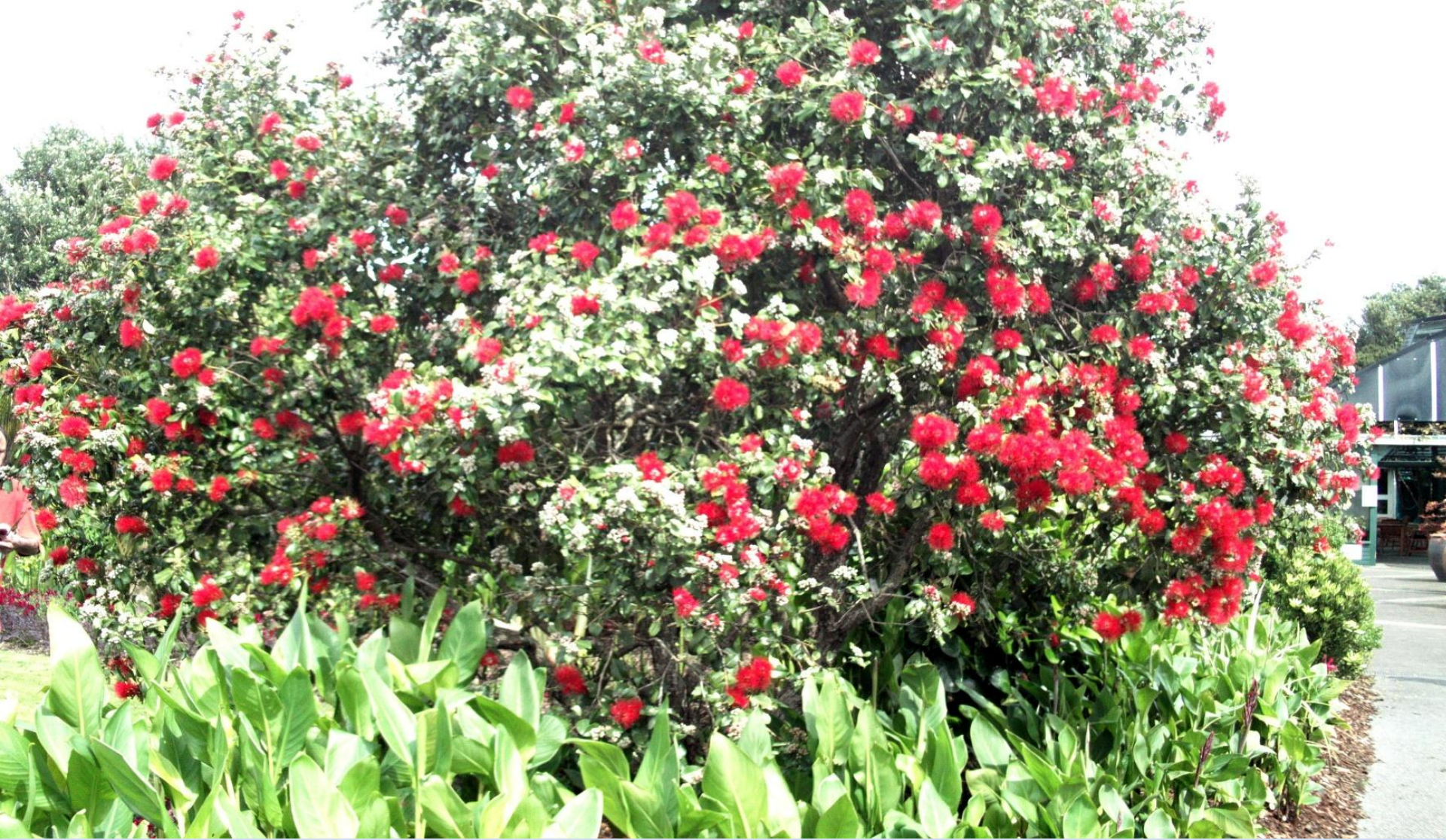
Metrosideros excelsa x M. collina