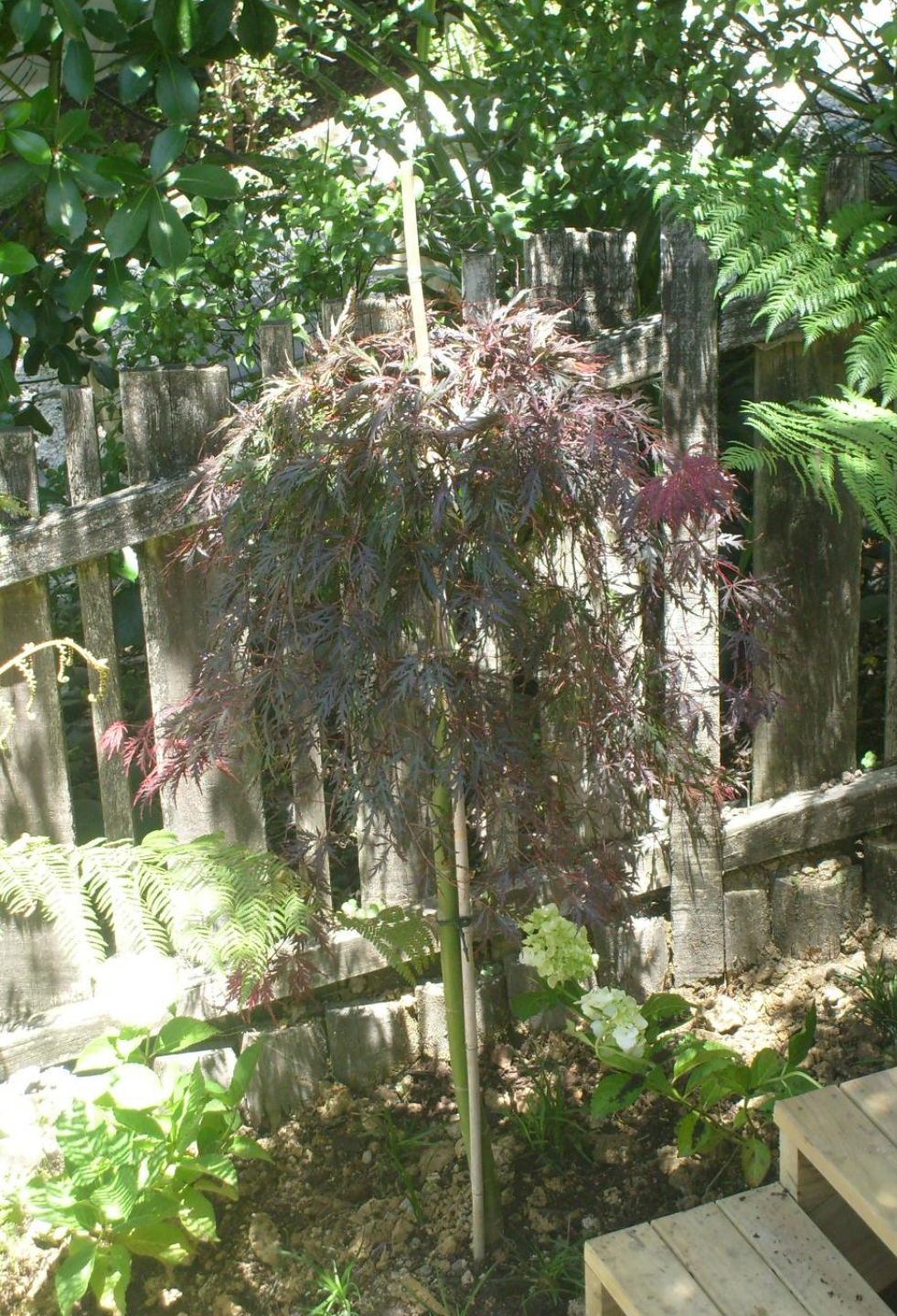
Acer palmatum var. dissectum forma atropurpureum 'Crimson Queen' weeping redlace, cutleaf, threadleaf Japanese maple