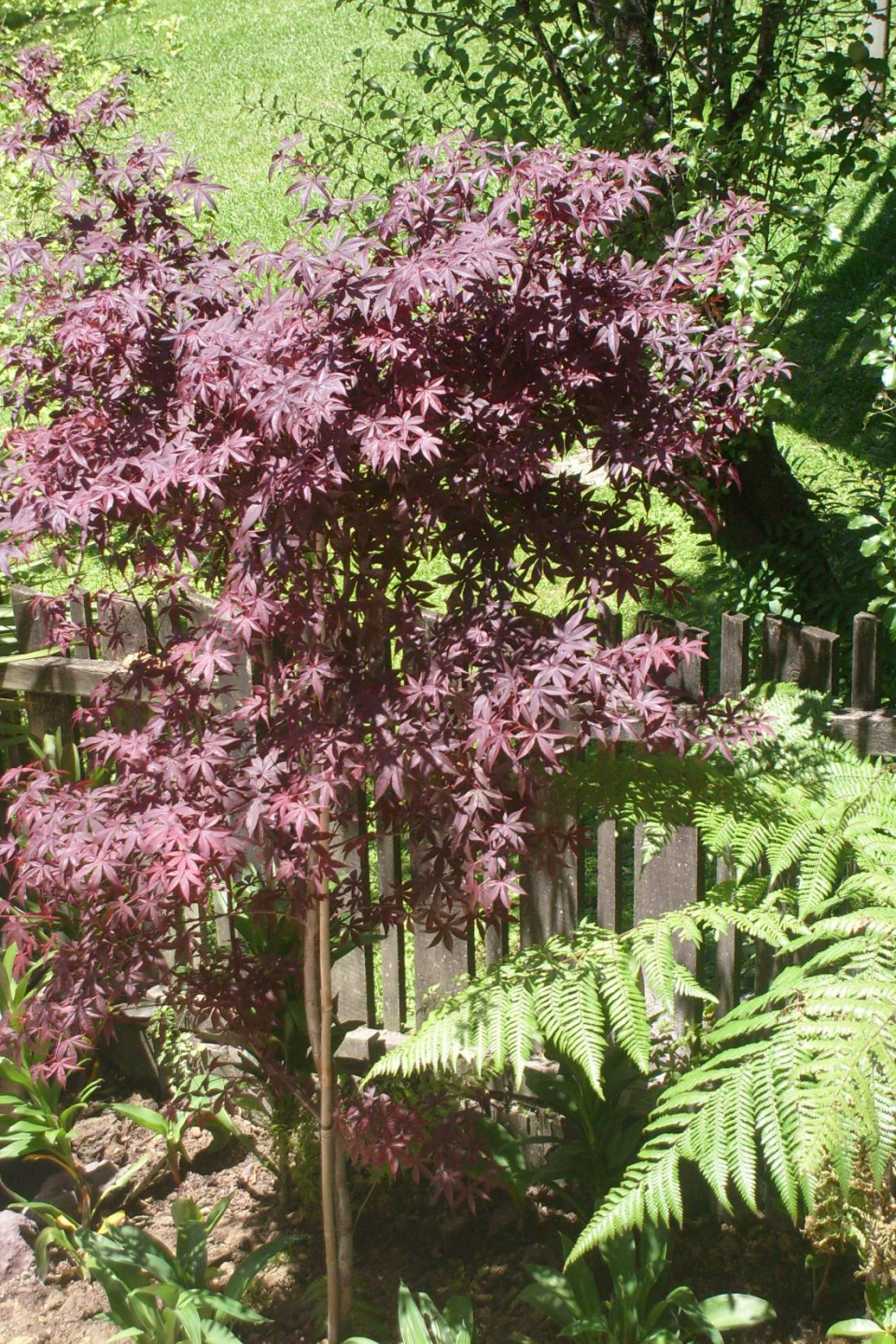
Acer palmatum 'Bloodleaf'