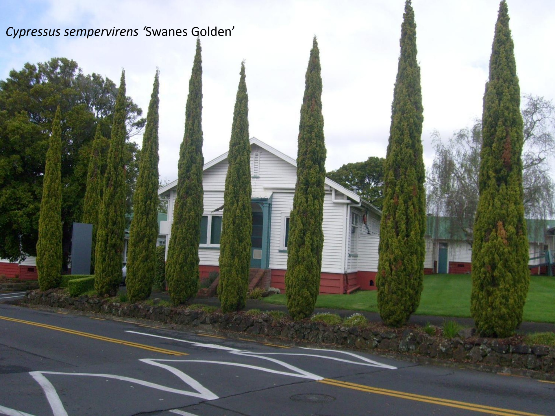
Cypressus sempervirens 'Swanes Golden'