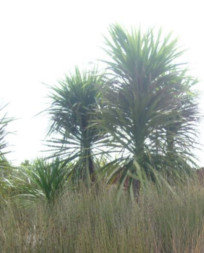
Cordyline australis - cabbage tree