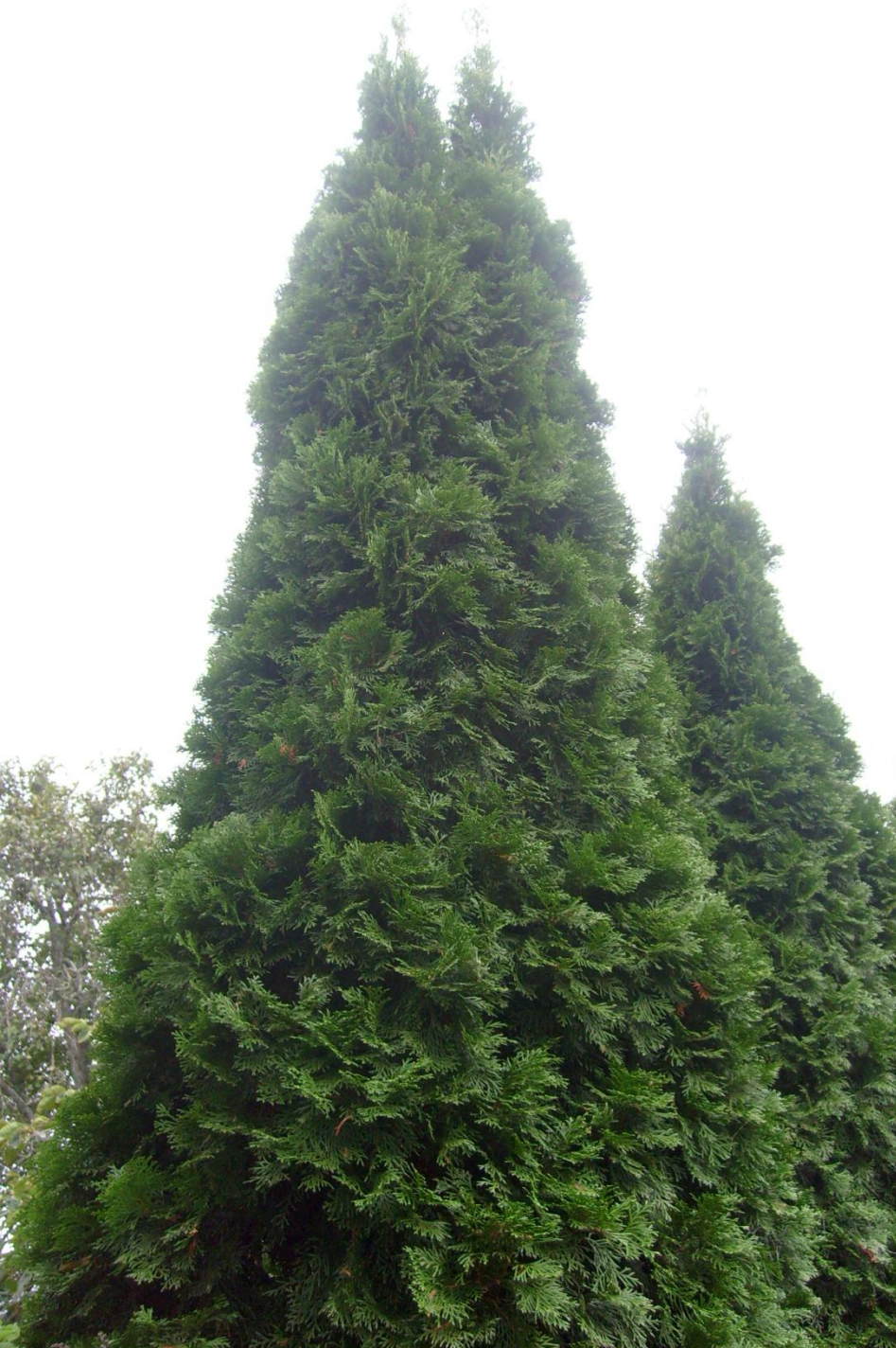
Thuja occidentalis 'Smaragd'