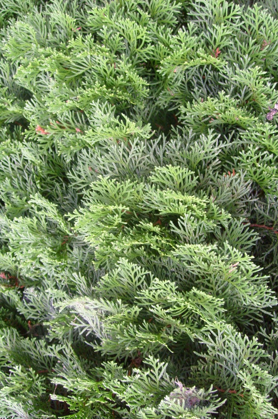
Thuja occidentalis 'Smaragd'